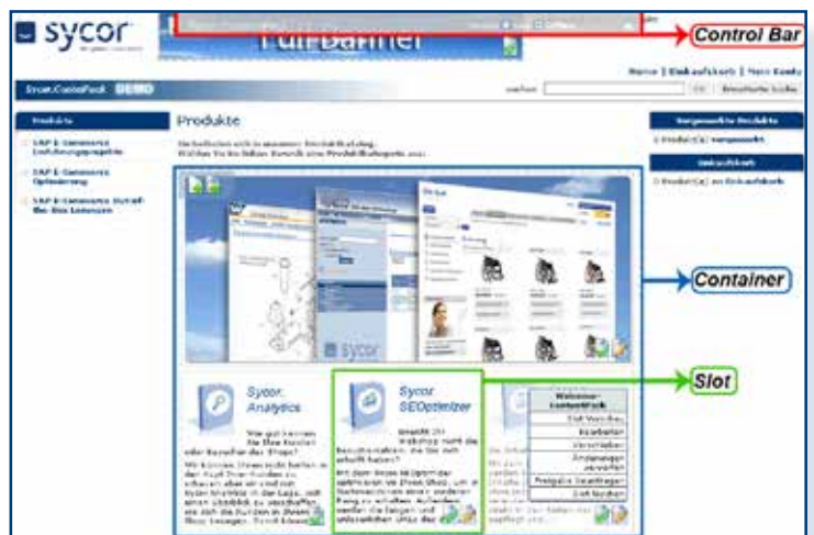
Structure of the Sycor.ContentPack