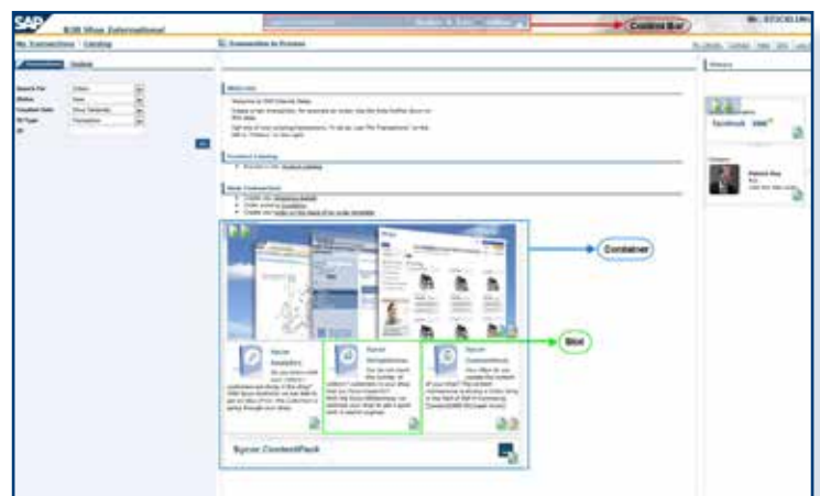
Structure of the Sycor.ContentPack